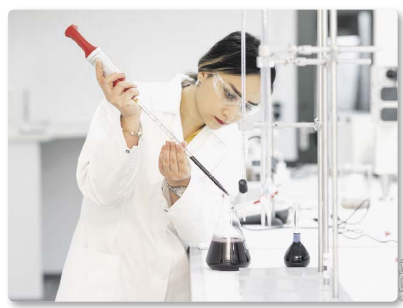
As a Dutch start-up, we are the first company to provide Ferrate(VI) for industrial applications.